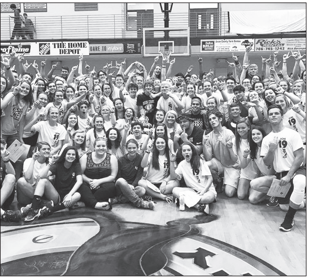
Union County High School's yearlong competition known as the "U-lympics" crowned a champion last Friday, and to the surprise of everyone - with the exception of the Class of 2019 - the sophomores reigned supreme. The final day of the U-lympics was expected to be one last coronation for the seniors - until the sophomores rained on their parade. The U-lympics are a competition between each grade that judges the entire class based on the performances of individuals. The students are not only judged in athletic prowess, but academics, behavior, school spirit, fewest library/lunch fines, and other factors throughout the school year. Spirit Week during the fall also plays a role in the crowning of a champion. The classes decorate and design a float for the Homecoming Parade that is judged by faculty. The classes are also scored on participation and school spirit throughout the week of Homecoming.